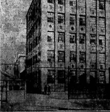
Permanent Home for Clerical Departments at Plant