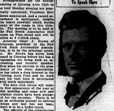
To Speak Here